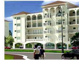
Perspective Independent Floors, New Town Heights DLF Gurgaon