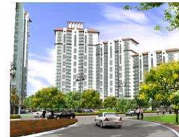
New Town Heights DLF Gurgaon