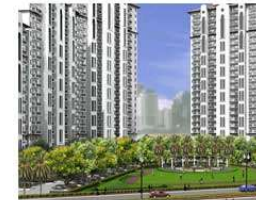
New Town Heights DLF Gurgaon