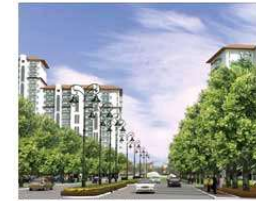
New Town Heights DLF Gurgaon