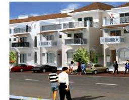
Perspective Townhouses, New Town Heights DLF Gurgaon

Architect:- M/s. Architect Hafeez Contractor. Client:- M/s. Star Alubuild Pvt. Ltd. Duration:- 2011-2012 Doors & Windows:- 1,00,000.00 Sqm (One Lac) Value :- 3300.00 Lacs